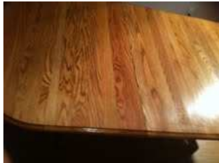
And here it is four hours later...

"If you can't feed a hundred people, then feed just one". ~Mother Theresa