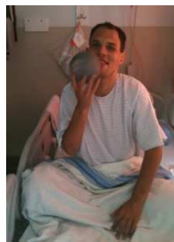
Not feeling well is a drag.